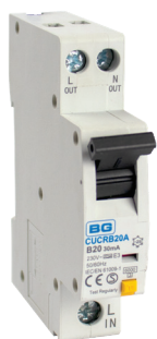
Compact RCBO Type A